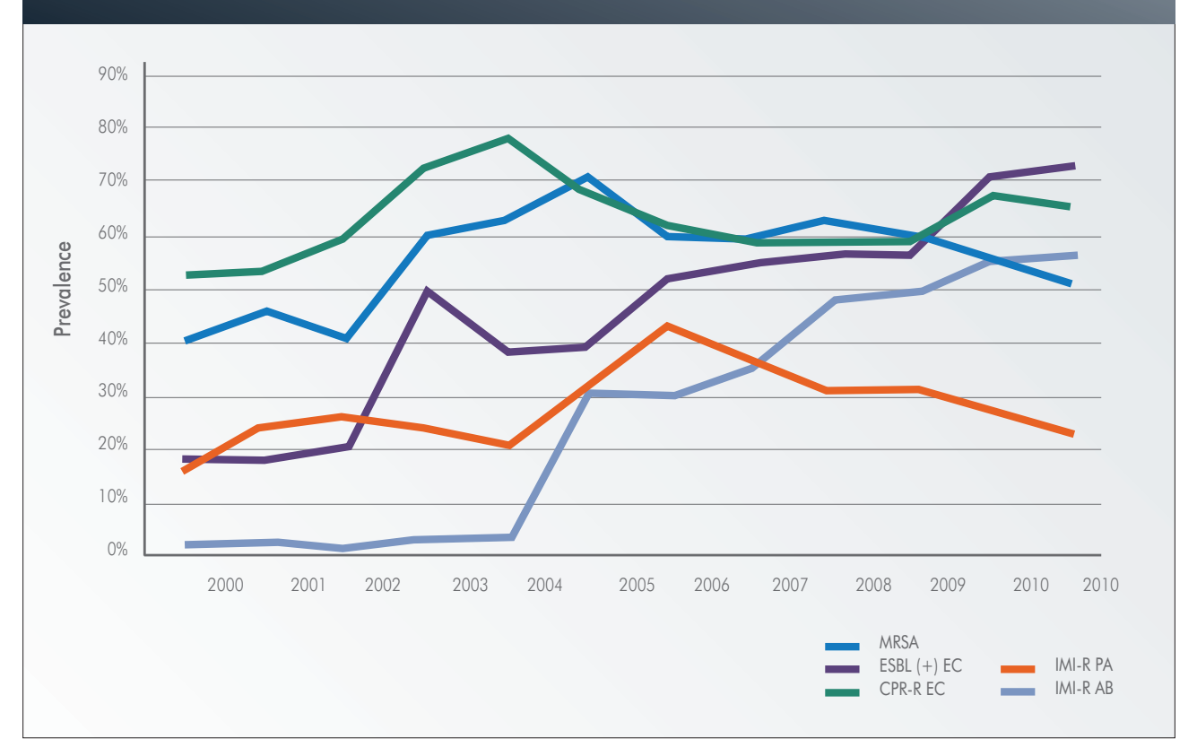
Figure 1: Resistance trends in the predominant antimicrobial-resistant bacteria in China from 2000 to 2011 (MRSA, Methicillin-resistant Staphylococcus aureus ; ESBL (+) EC, extended-spectrum β-lactamase producing Escherichia coli ; CPR-R EC, ciprofloxacin-resistant Escherichia coli ; IMI-R PA, imipenem-resistant Pseudomonas aeruginosa ; IMI-R AB, imipenem-resistant Acinetobacter baumannii ).